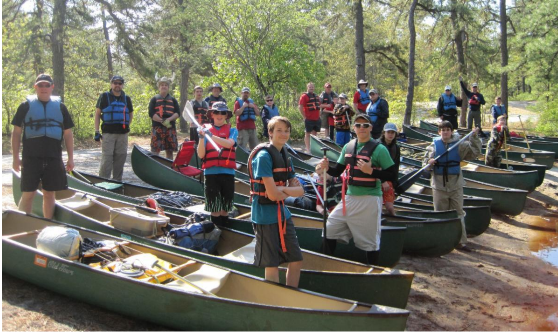
Troop 3 on the Mullica River - May 2014