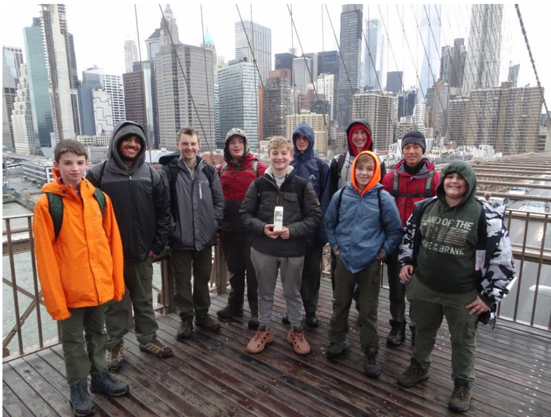
Scene from the Brooklyn Bridge - March 2023