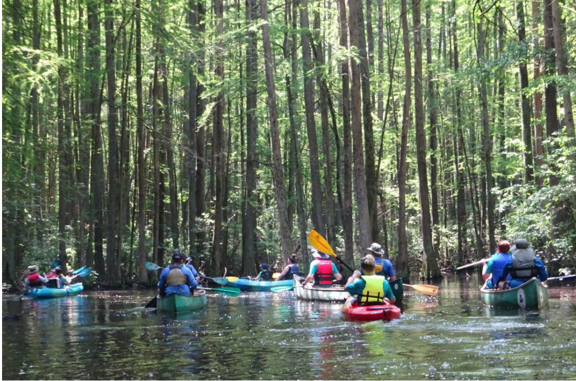
Paddling through the Cyprus trees at Trap Pond State Park in June 2025.