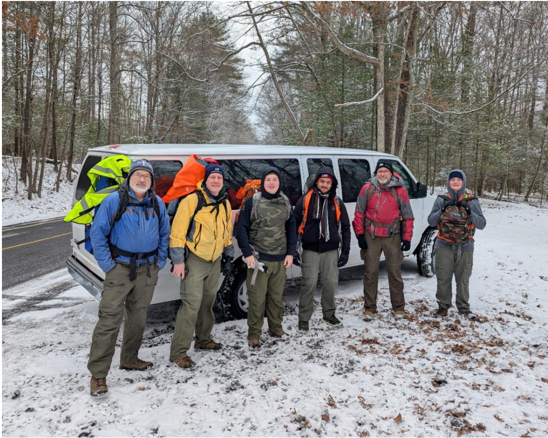
Crew 3 Mount Washington training trip to Rausch Gap in January 2025