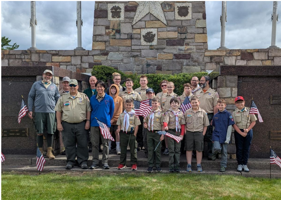
Preparing for Memorial Day at Whitmarsh Memorial Park in May 2025.