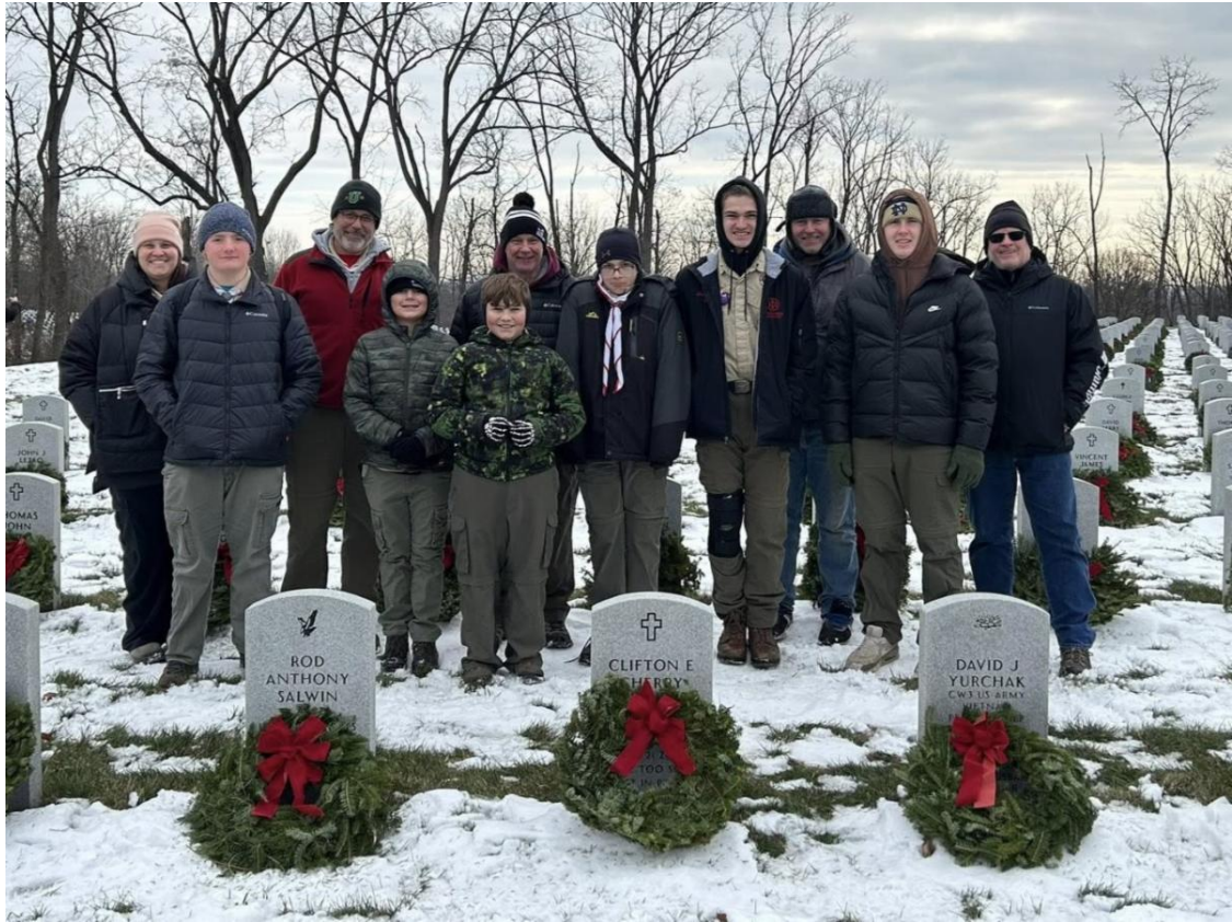
A very brisk day laying wreaths at Indiantown Gap National Cemetery in December 2025.