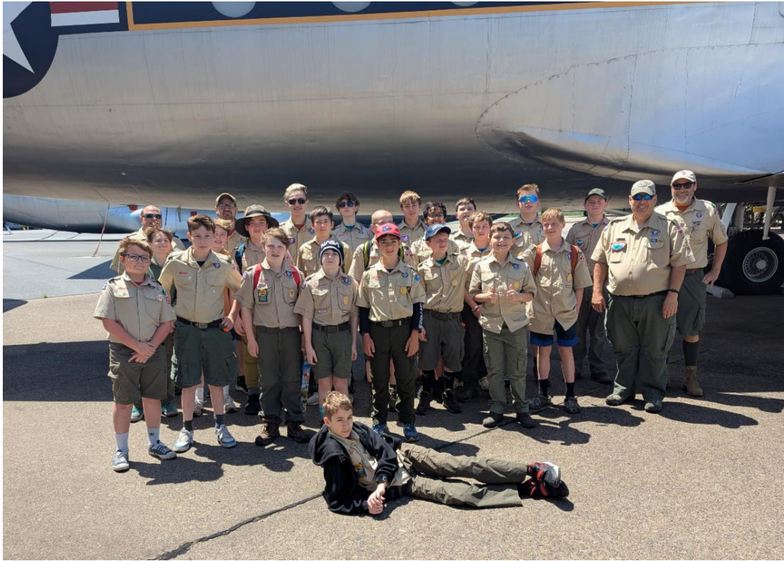
Troop 3 at the Mobility Command Museum at Dover Air Force Base in May 2025.