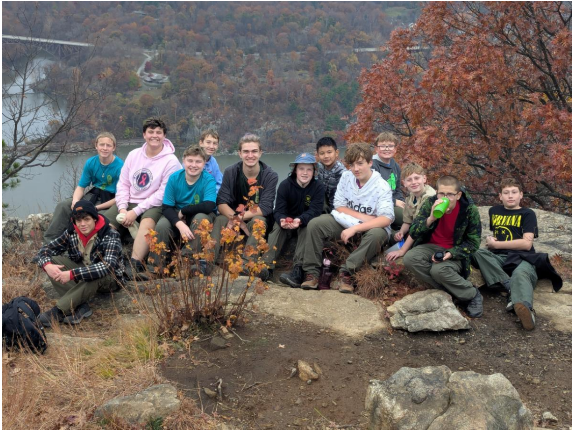
A well earned view of the Hudson Valley from Anthony's Nose in November 2025.