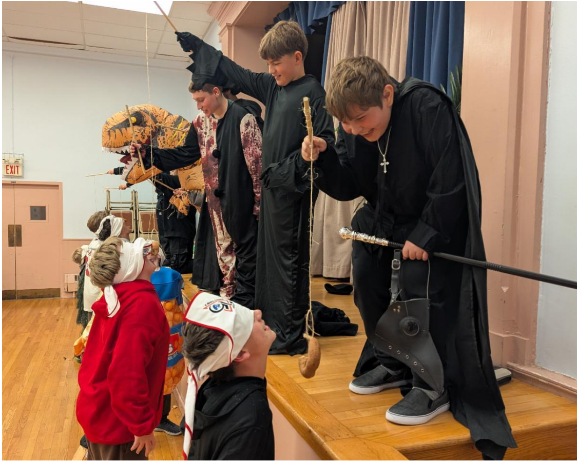
Donut fishing at our Annual Halloween Party in October 2025.