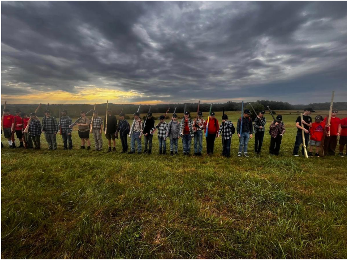
Troop 3 is drafted into the Union Army at Gettysburg in September 2025.