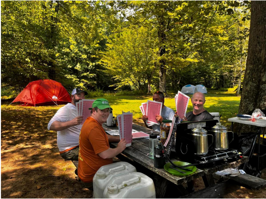
A big game of '31' broke out at Ole Bull State Park in August 2025.