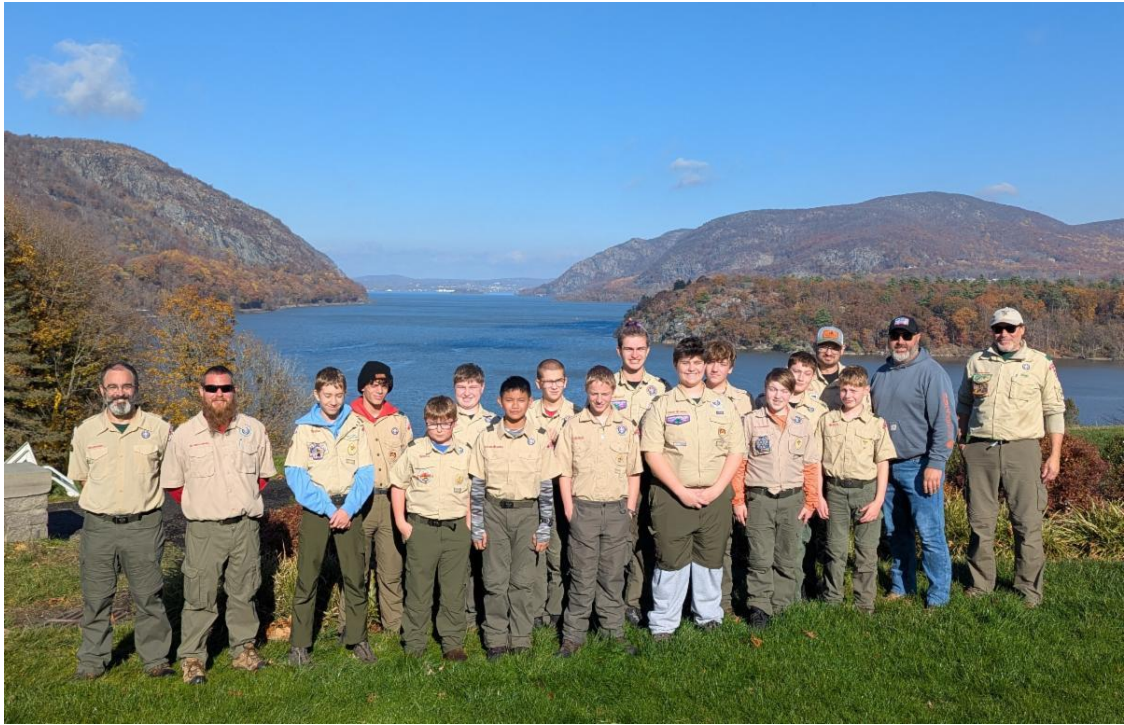
A gorgeous day at "the Point where the river turns West" in November 2025.