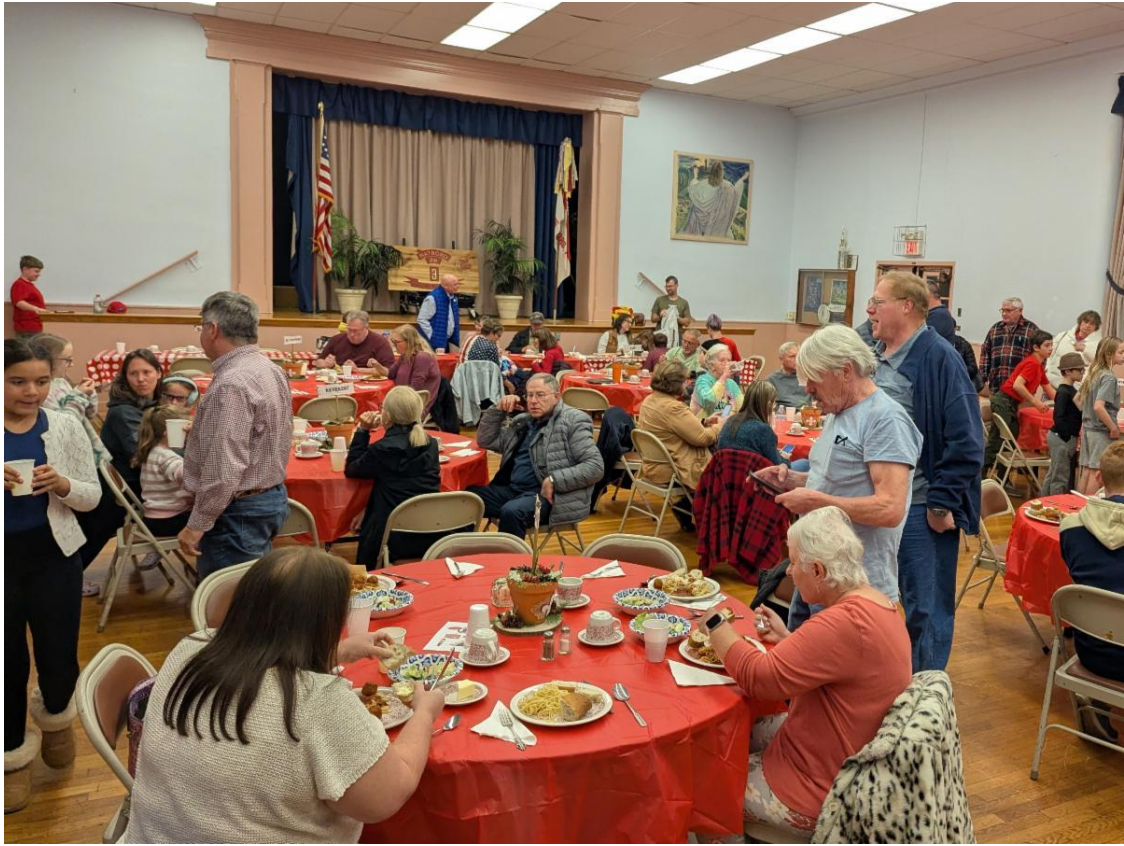
A full house at our First Annual Spaghetti Dinner in November 2025.