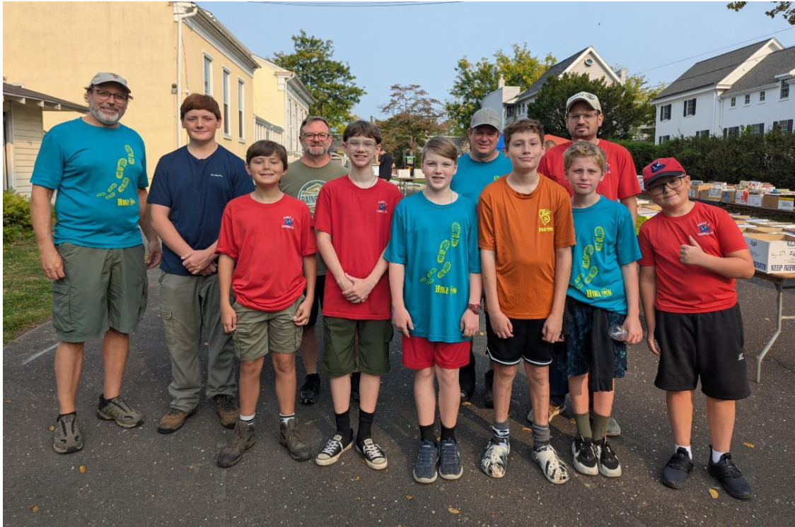
Setting up for the Booksale at the Union Library in September 2025.