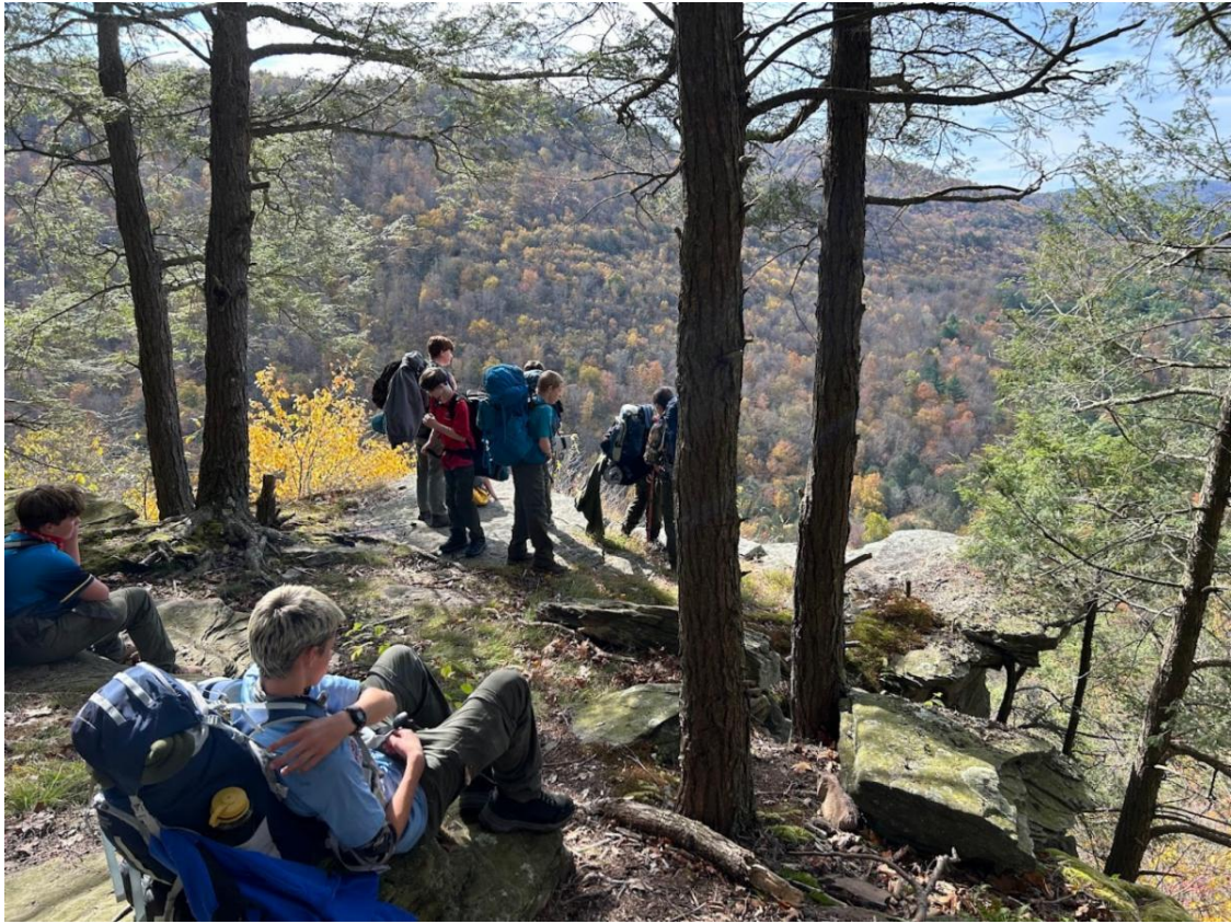
Pack-off Break at World's End State Park in October 2025.