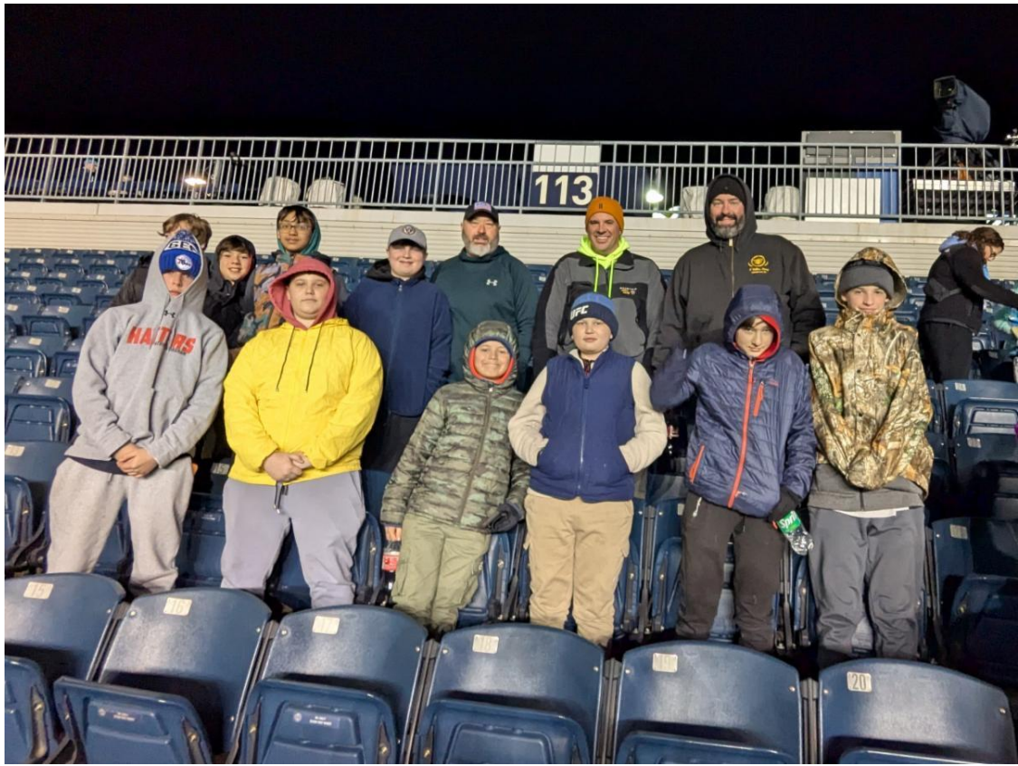
Troop 3 at Subaru Stadium for a Philadelphia Union Soccer Match in March 2025.