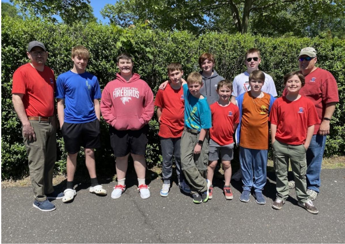
Another Good Turn at the Union Library in May 2025. Taking down the Booksale.