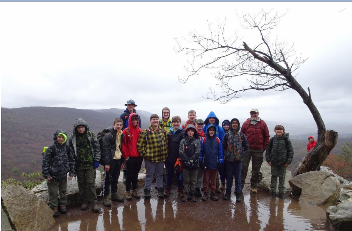
A soggy Spring day at Hawk Mountain in April 2025.