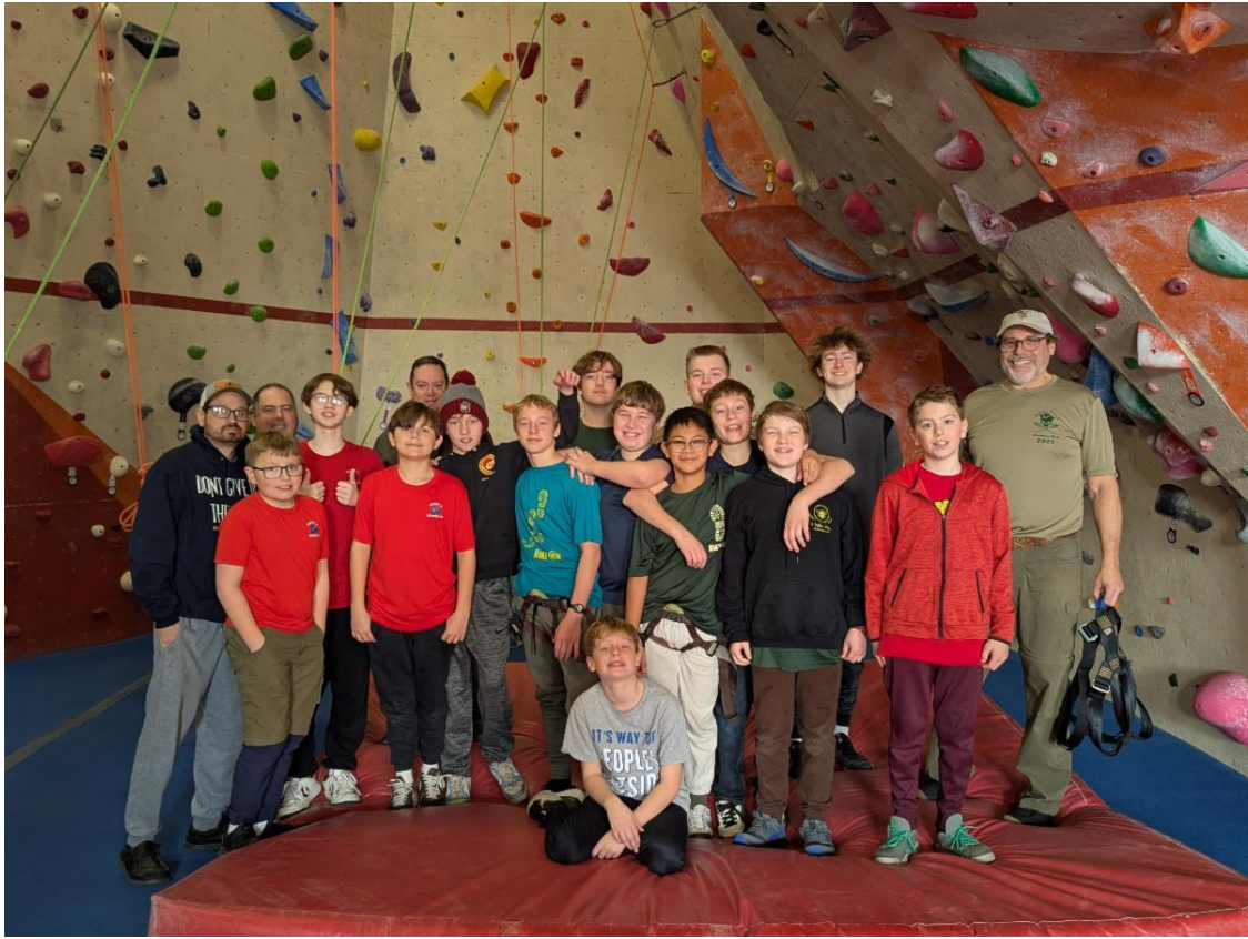
Overnight at the Doylestown Rock Gym in December 2025.