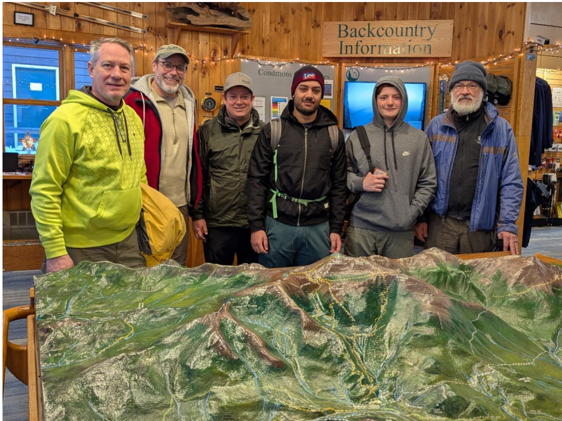
Venture Crew 3 with the obligatory before shot with the map at Pinkham Notch Visitor Center. We eat a hearty breakfast before hitting the Tuckerman Ravine Trail, February 2025