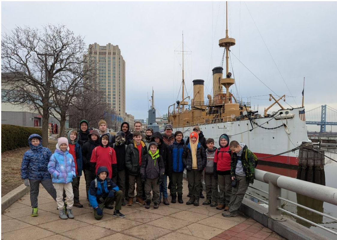
Troop 3 at Penn's Landing with the USS Olympia in January 2025.