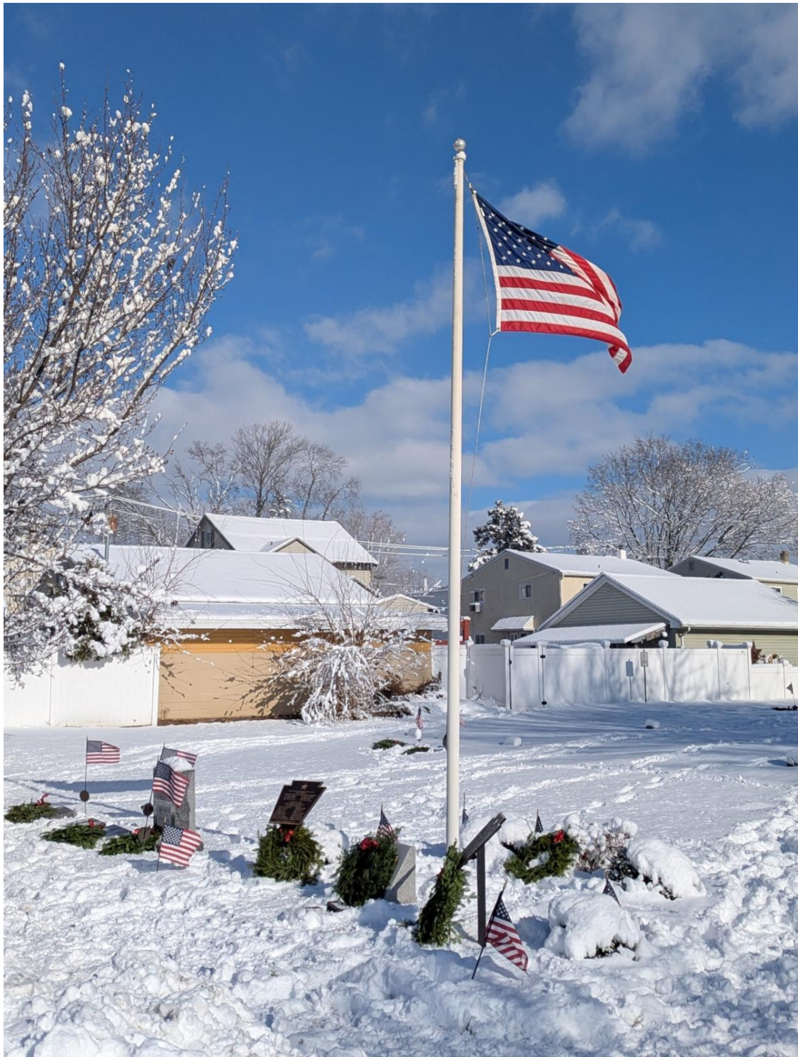
Wreaths Across Hatboro at the Hatboro Baptist Cemetery Veterans Memorial