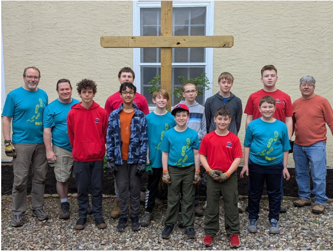
Good Turn in April 2025, mulching the flower beds at the Church.