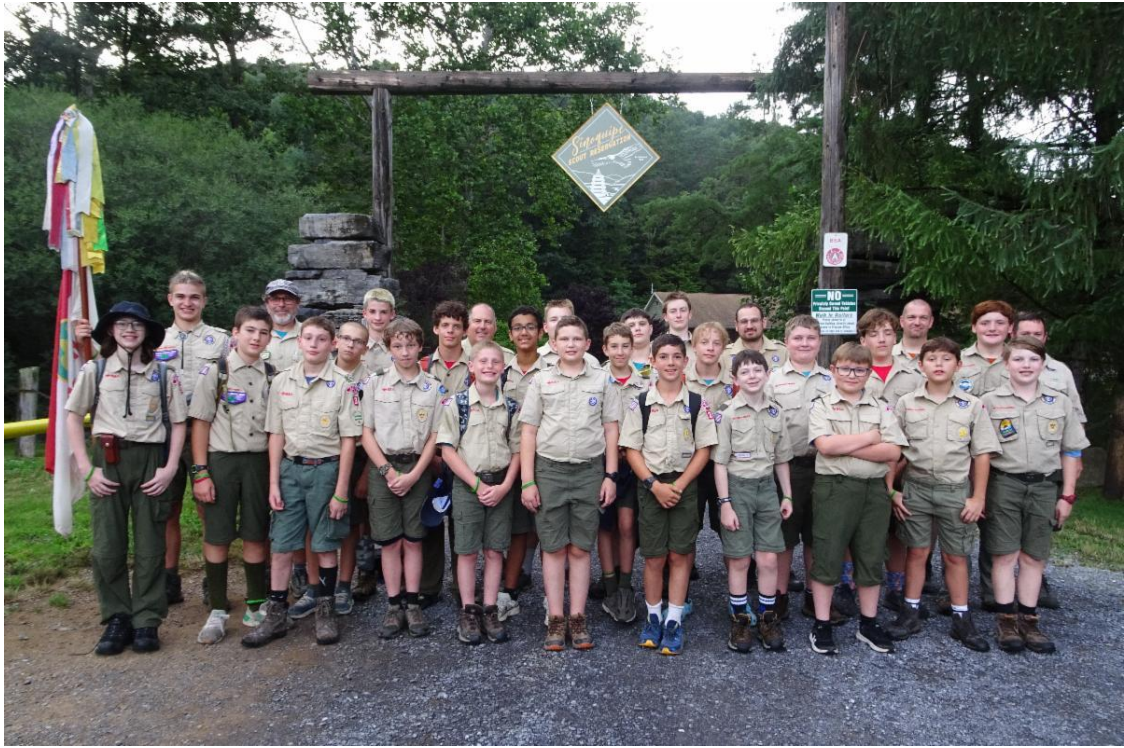
Summer Camp at Sinoquipe Scout Reservation in July 2025.