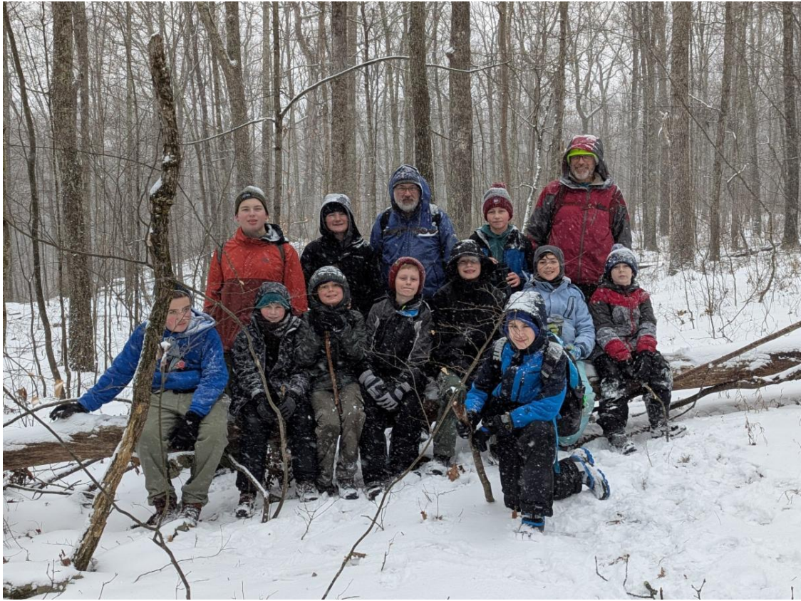
Snowy hike on the Silver Trail at Resica Falls, January 2025