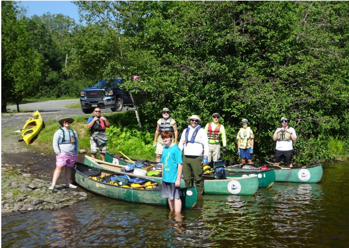
Venture Crew 3 hitting the Allagash Wilderness Waterway at Chamberlain Bridge in July 2025.