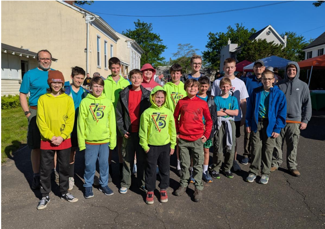
Good Turn at the Union Library in May 2025. Setting up for the Booksale.