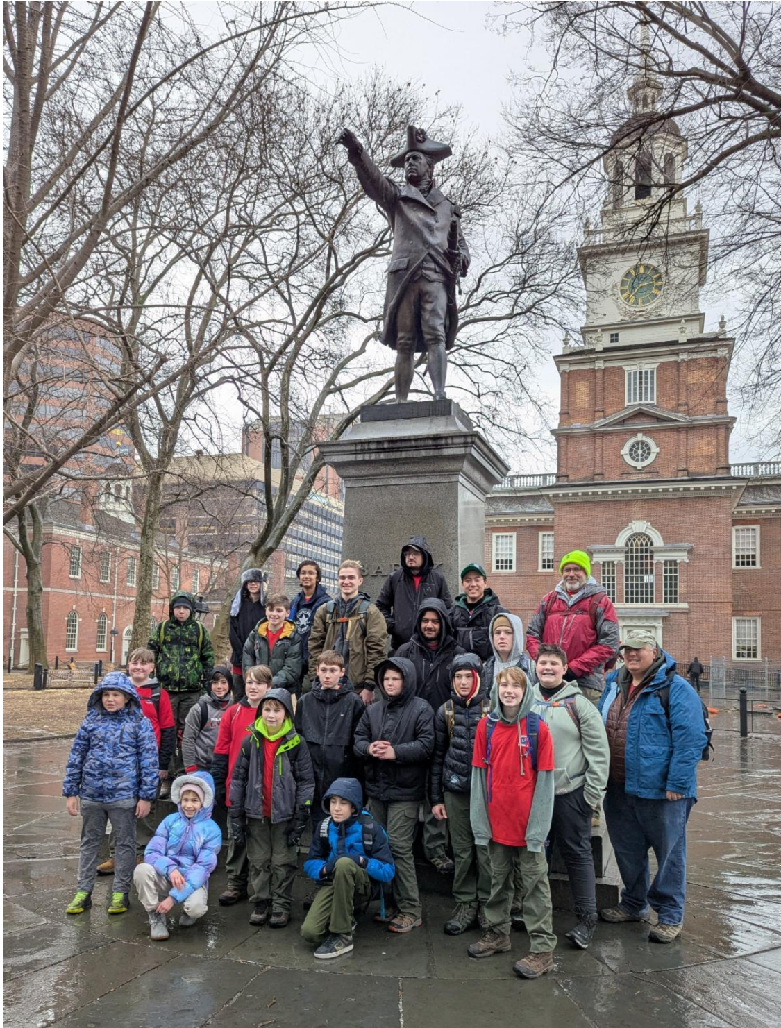
Troop 3 with Commodore Barry in January 2025