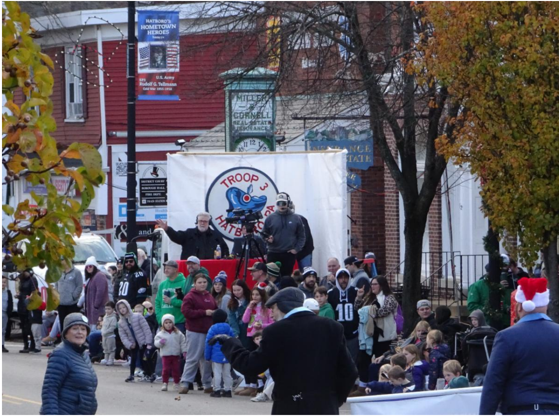
VT3 manning the Broadcasting Area at the Hatboro Holiday Parade, November 2025.