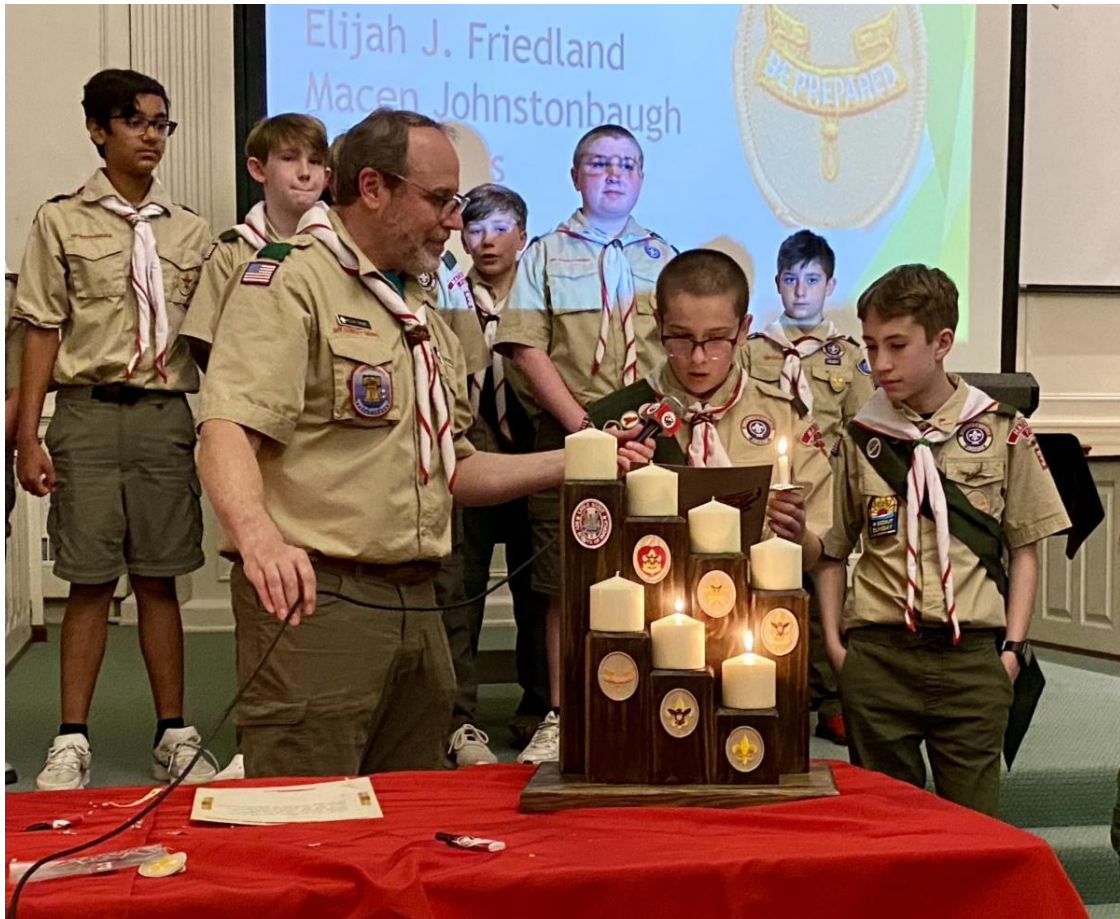
Advancement Recognition at Parents Night in May 2025.