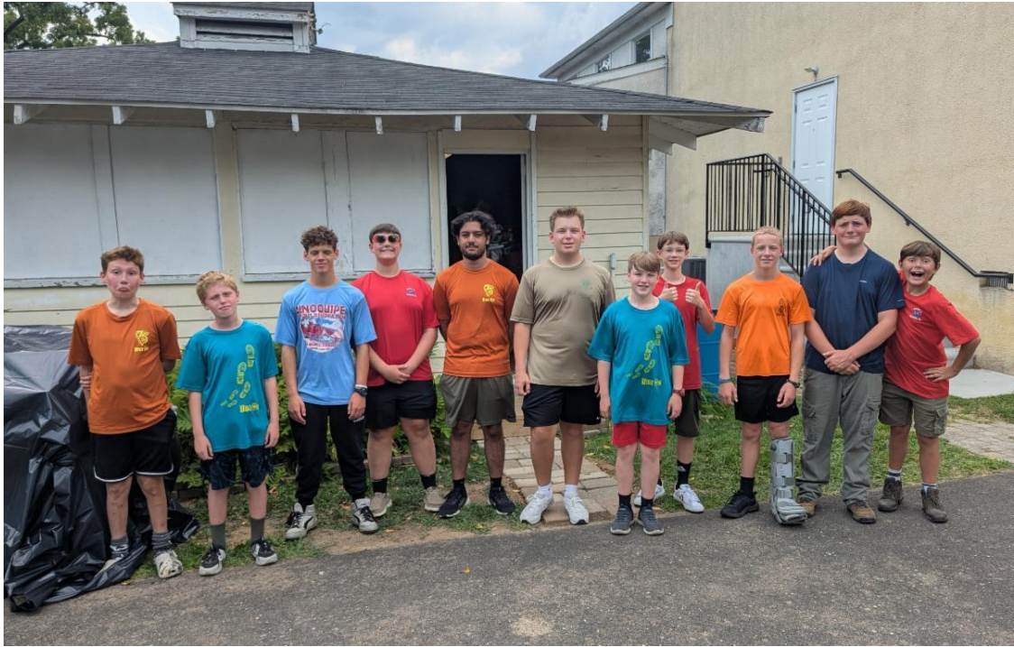
Breaking down from the Booksale at the Union Library in September 2025.