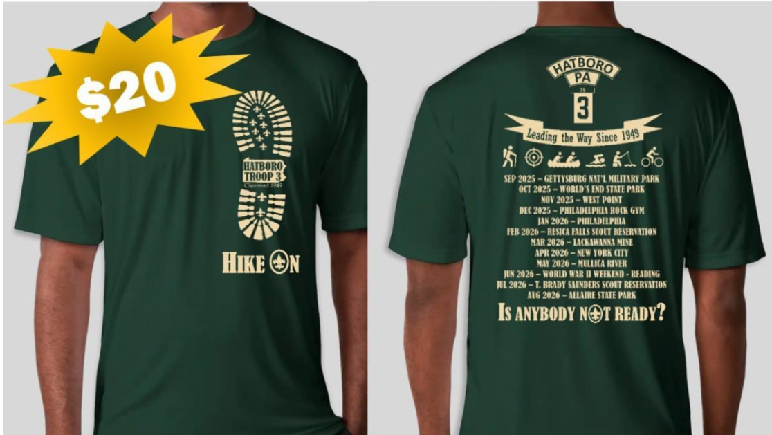
Sport-Tek Competitor Performance Shirt Warm Ivory on Forest Green