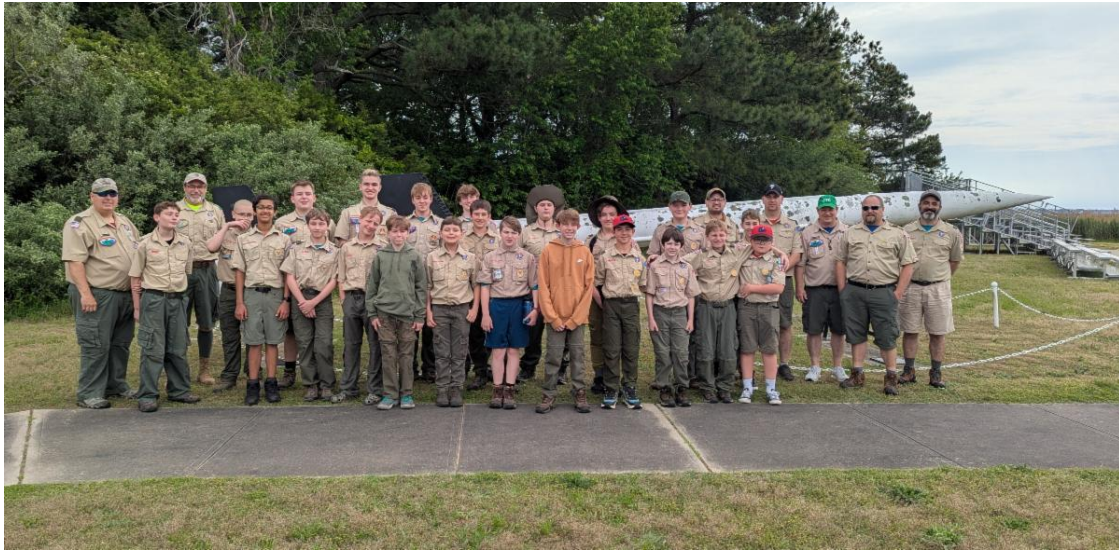
Saturday morning at NASA Wallops Island. What a great little museum!