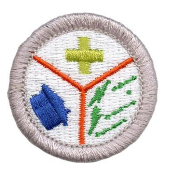
Emergency Preparation Cameron Arbuckle