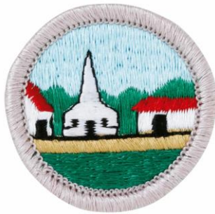
Citizenship in the Community Aidan Wills