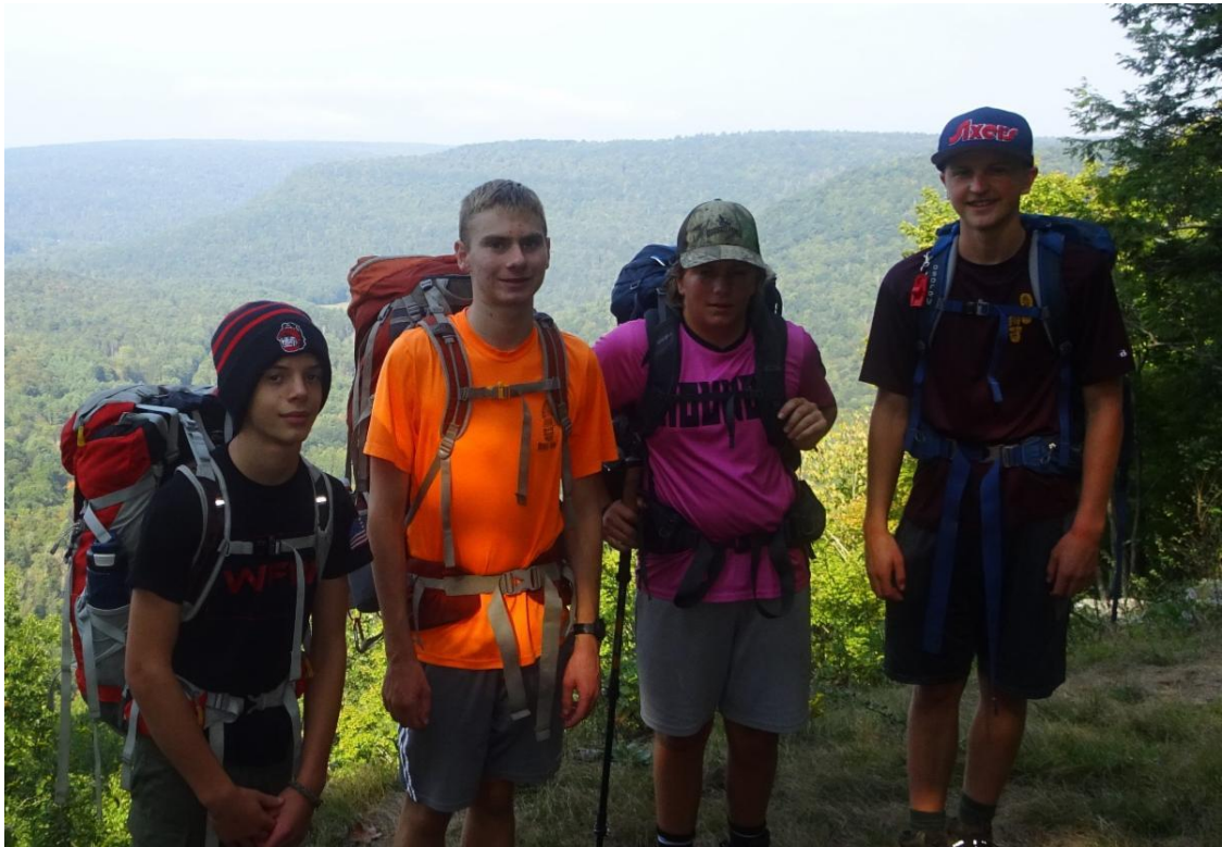
September 16-18th - We backpacked 13 miles of the Loyalsock Trail through World's End State Park.