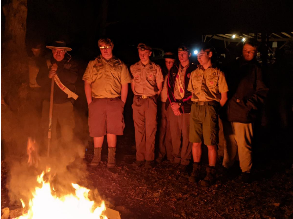
April 22-24th - Spring cleaning at College Settlement's Spruce Run Outpost. The Scouts had time to build wilderness survival shelters. We also had a campfire with an OA Tap-out.