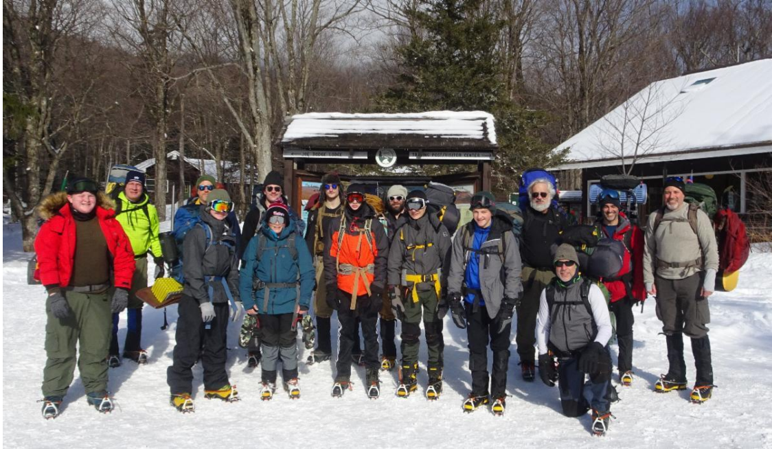
February 26th - March 1st - Crew 3 made the annual trek to Mt. Washington in the White Mountains of New Hampshire. We did not make the summit, but we have a determined group for 2023!