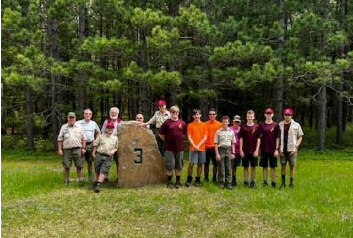
May 20-22nd - Backpacking the Quehanna Trail.