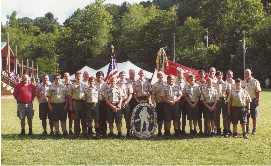
July 9-17th - Summer camp at Camp Daniel Boone in the Pisgah National Forrest in North Carolina