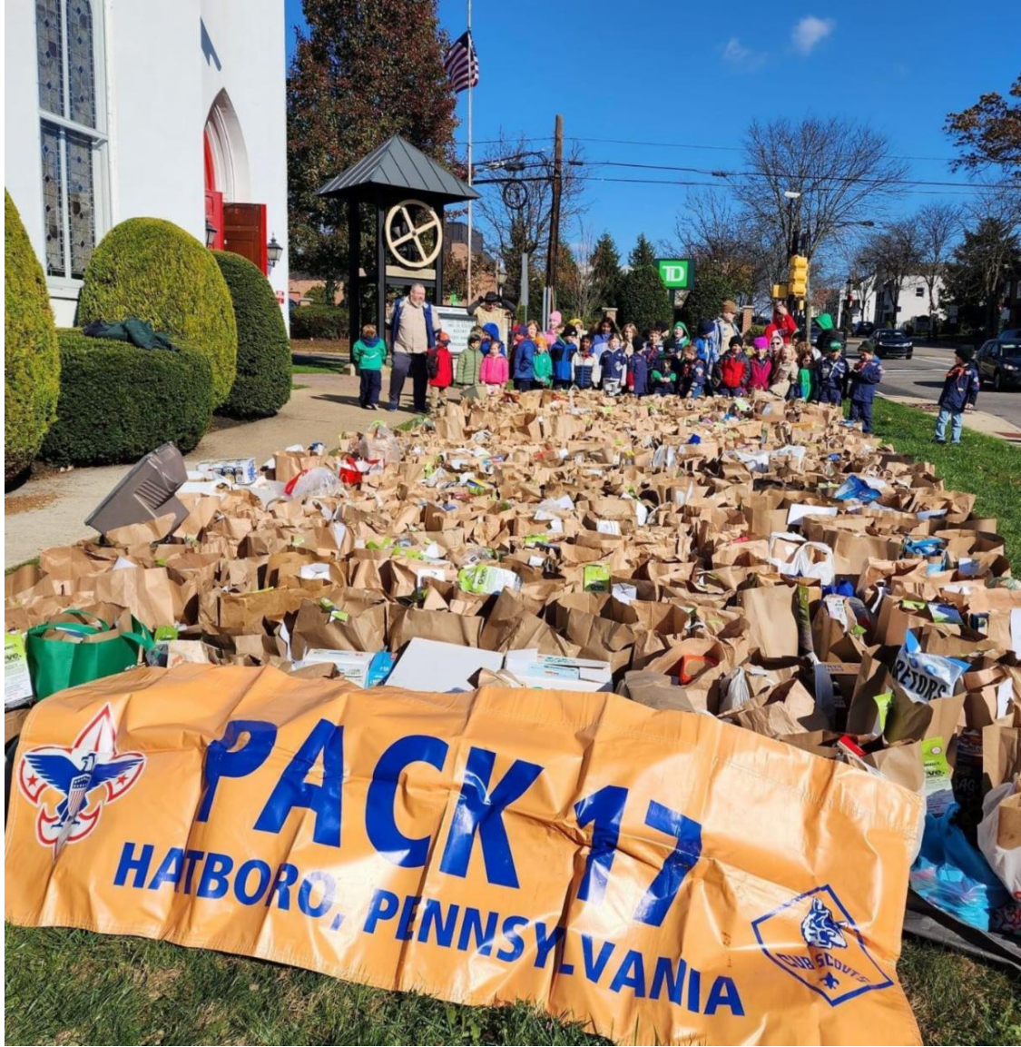
November 19th - We helped out Pack 17 with collecting food items for Scouting for Food