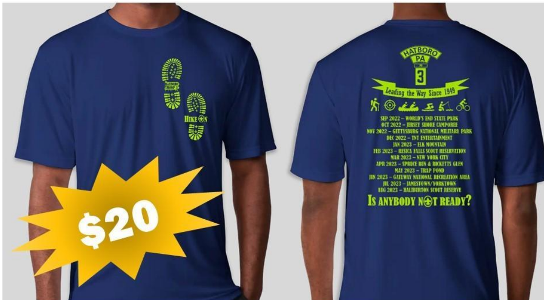
Sport-Tek Competitor Performance Shirt Vibrant Green on True Royal

The new 2022-2023 Troop T-Shirts are in! I'll bring them to the next few troop meetings.