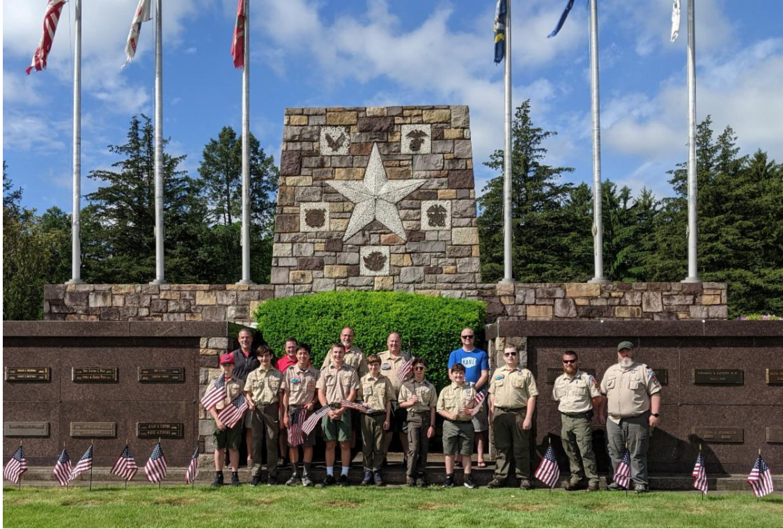
May 28th - Placing flags at Veteran's graves for Memorial Day at Whitmarsh Cemetery.