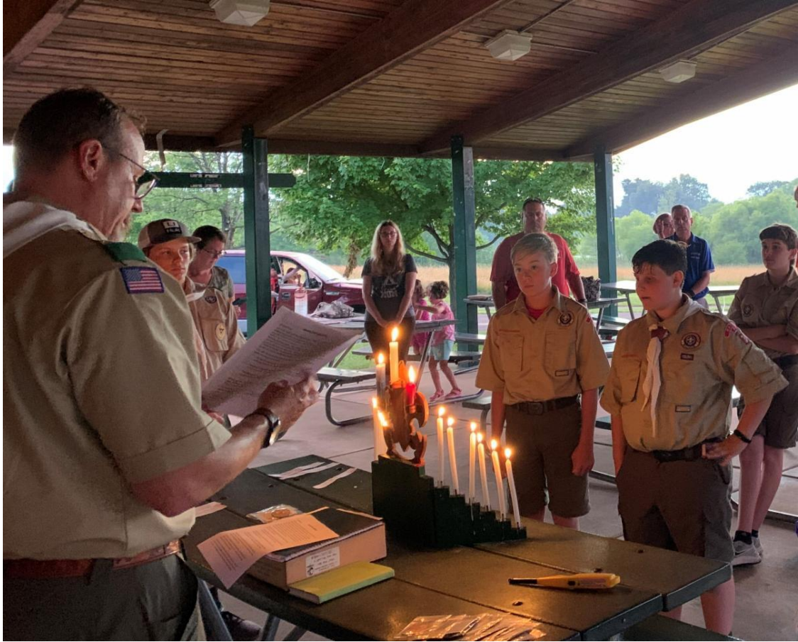
June 27th - Investiture Ceremony at Warminster Community Park.