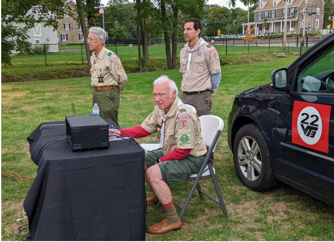
September 24th - VT3 provided the sound stage for the dedication ceremony for the Hatboro Gold Star Memorial Garden.