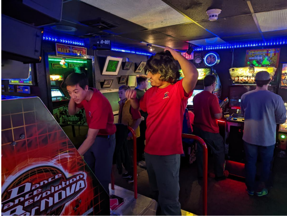
December 3rd - We had a great time at TNT Amusements, including a tour of the shop!