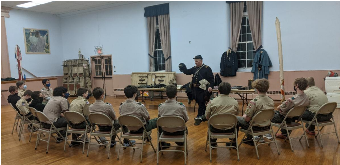
February 7th - We were paid a visit by a Civil War Reenactor.