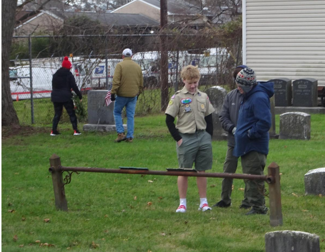
December 18th - We held our own Wreaths Across Hatboro at the Hatboro Baptist Cemetery. Much smaller scale than Arlington, but no less meaningful.