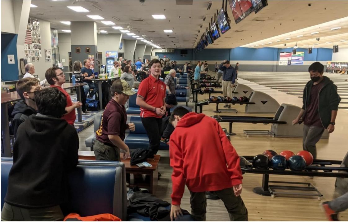
January 24th - Bowling Night at Thunderbird Lanes.