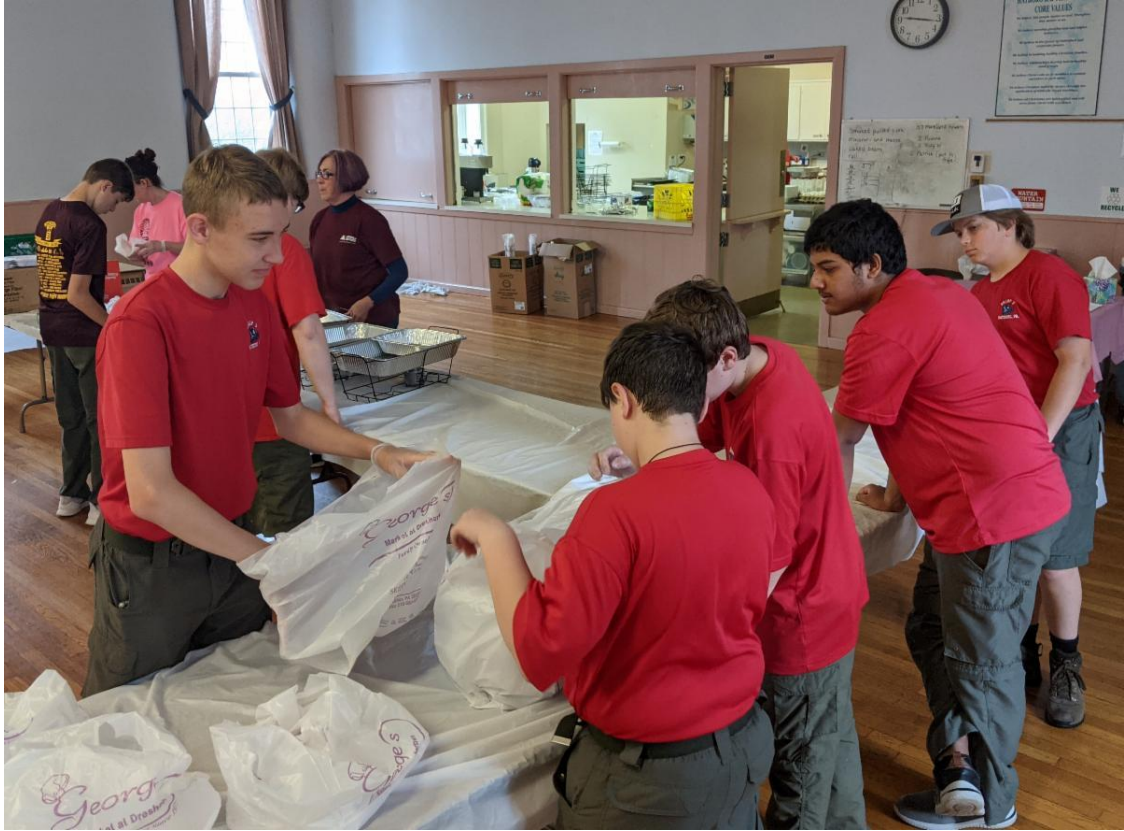
May 14th - Spring fundraiser Pancake Breakfast.