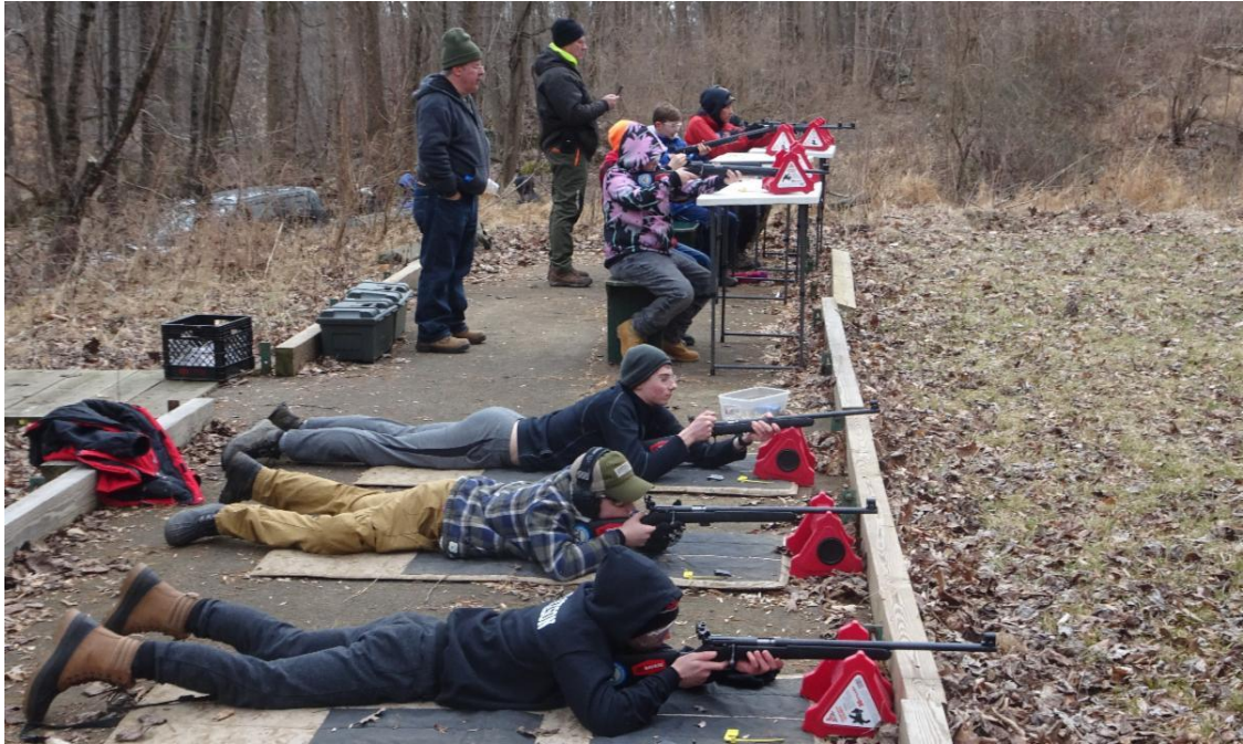
February 19th - Lots of Shooting at Musser.