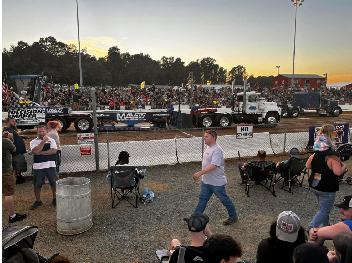
August 19-21st - We camped at Susquehannock State Park and enjoyed the show at Buck Motorsports Saturday night.