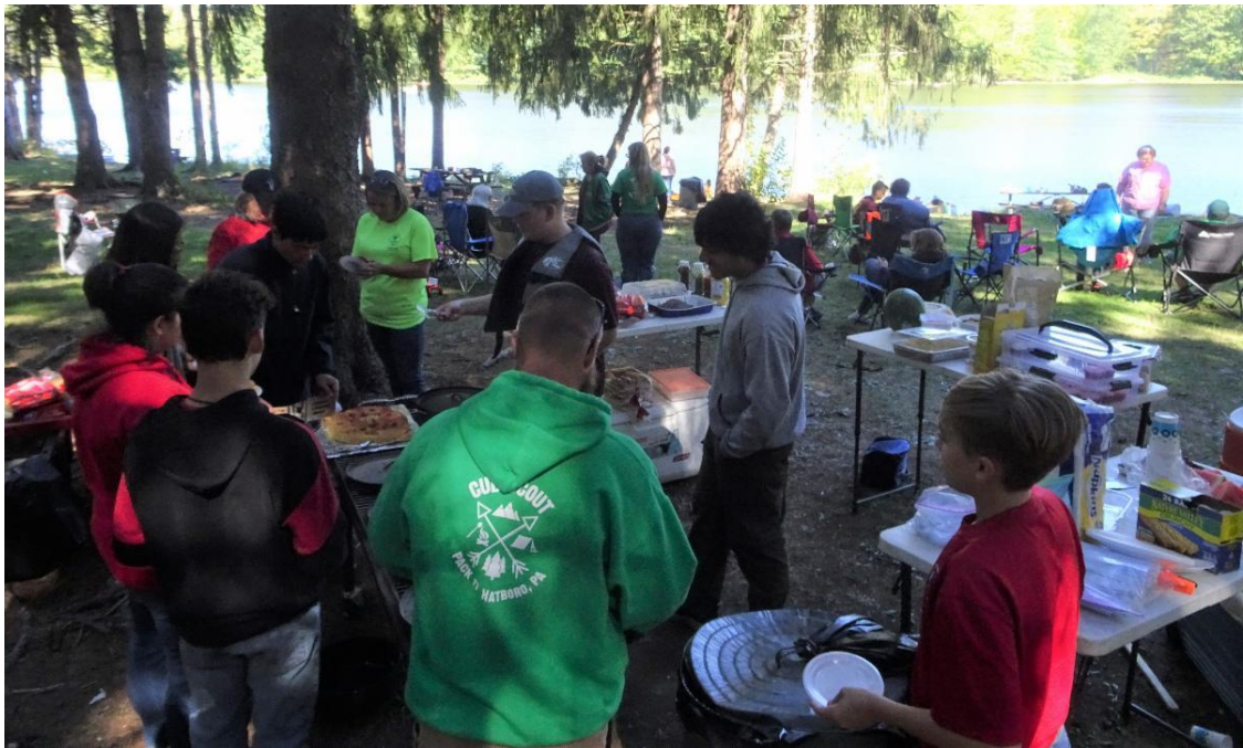
September 24th - We held a Troop 3 Family Picnic at Lake Nockamixon, and had several Cub Scout families join us.