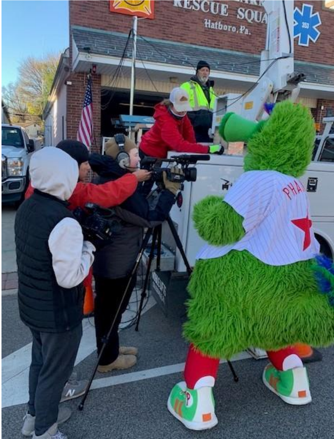
November 20th - VT3 provided A/V support for the Hatboro Holiday Parade