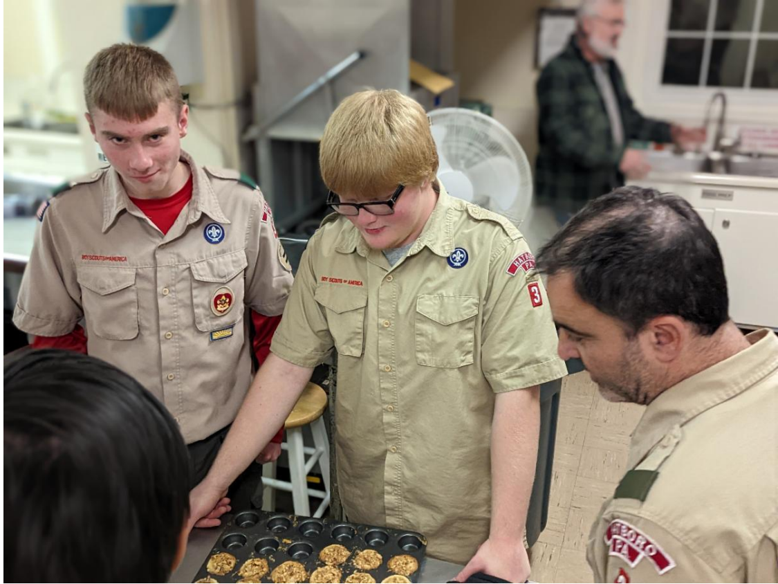
November 29th - Cookie Wars!