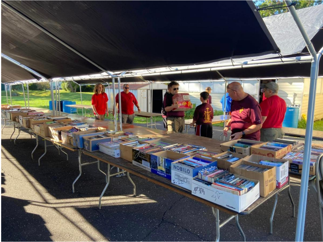
September 10th - Hatboro Union Library Book Sale.