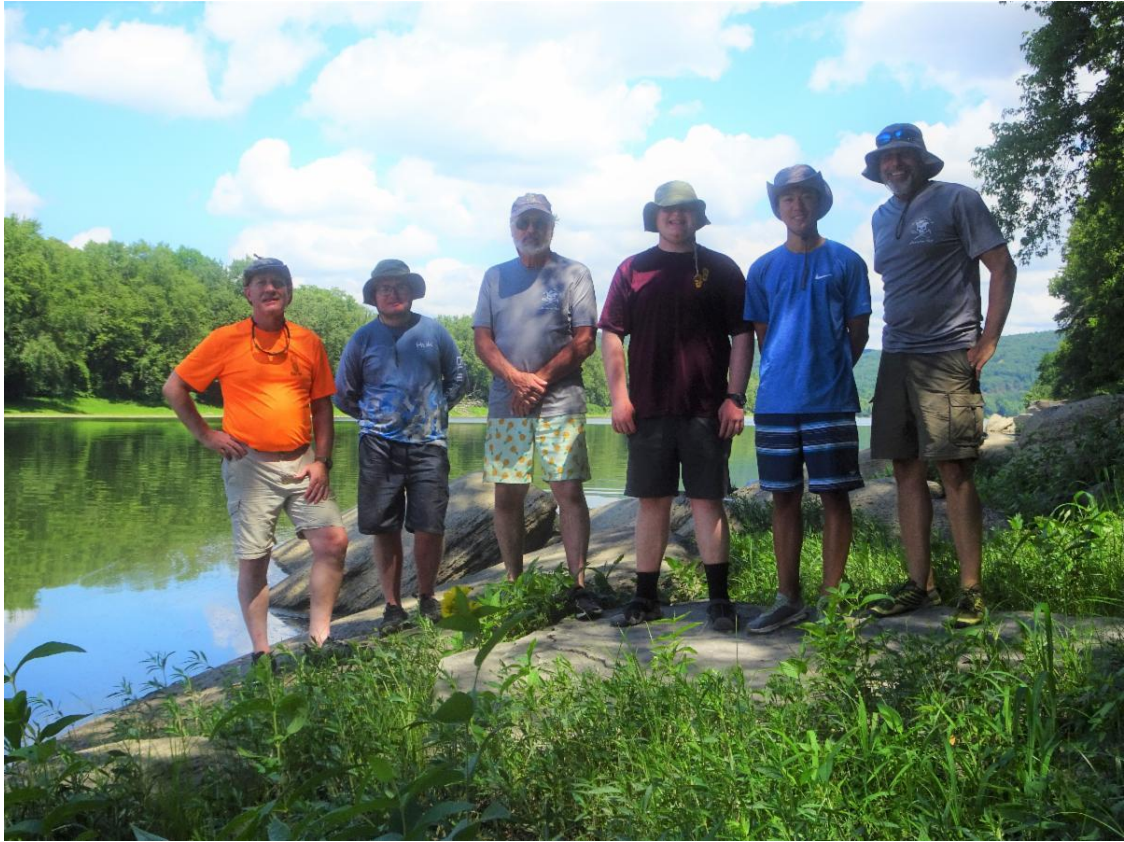
July 30th - August 4th - Crew 3 paddled 87 miles of the Upper Susquehanna River then spent the day a Knoebels.