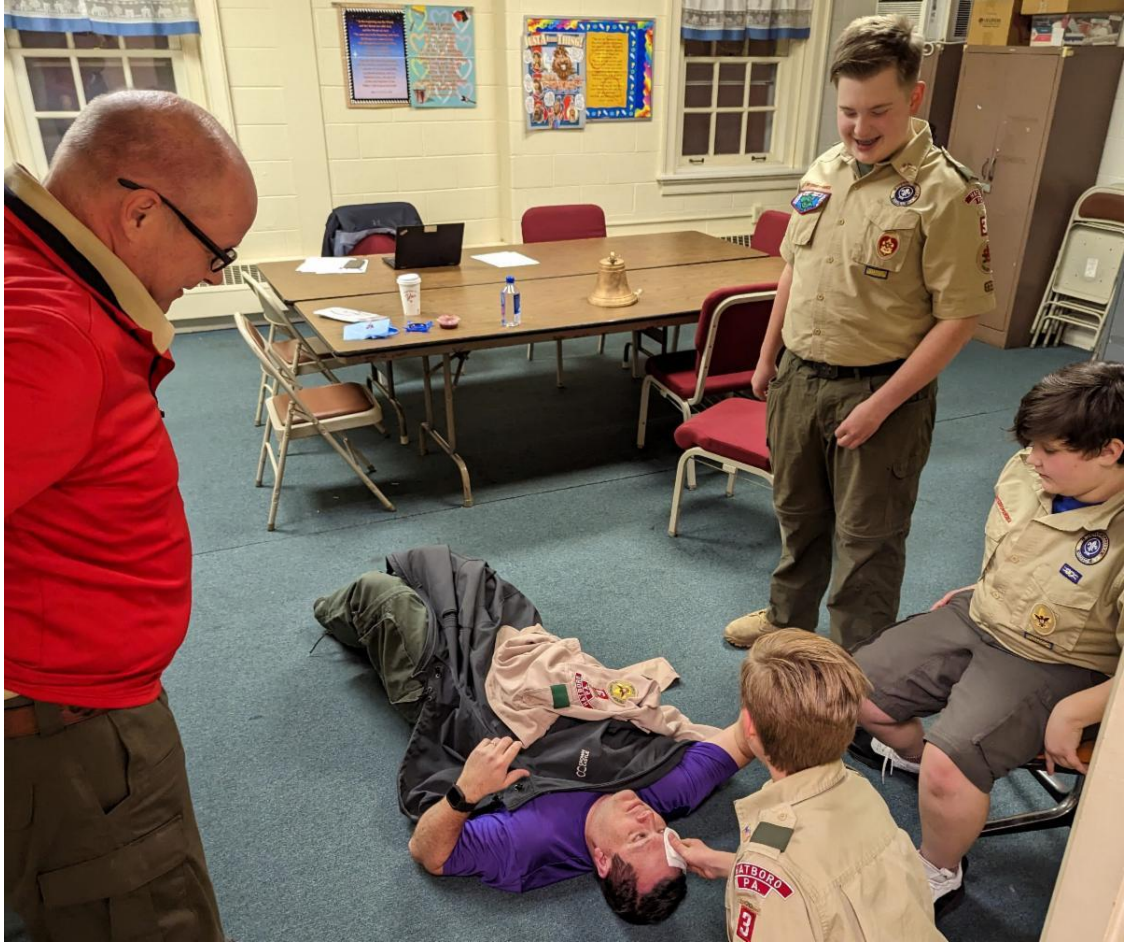
December 12th - We did live first aid at several stations around the church.