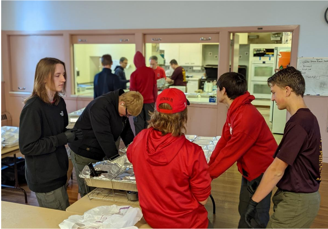
October 22nd - Fall fundraiser Pancake Breakfast