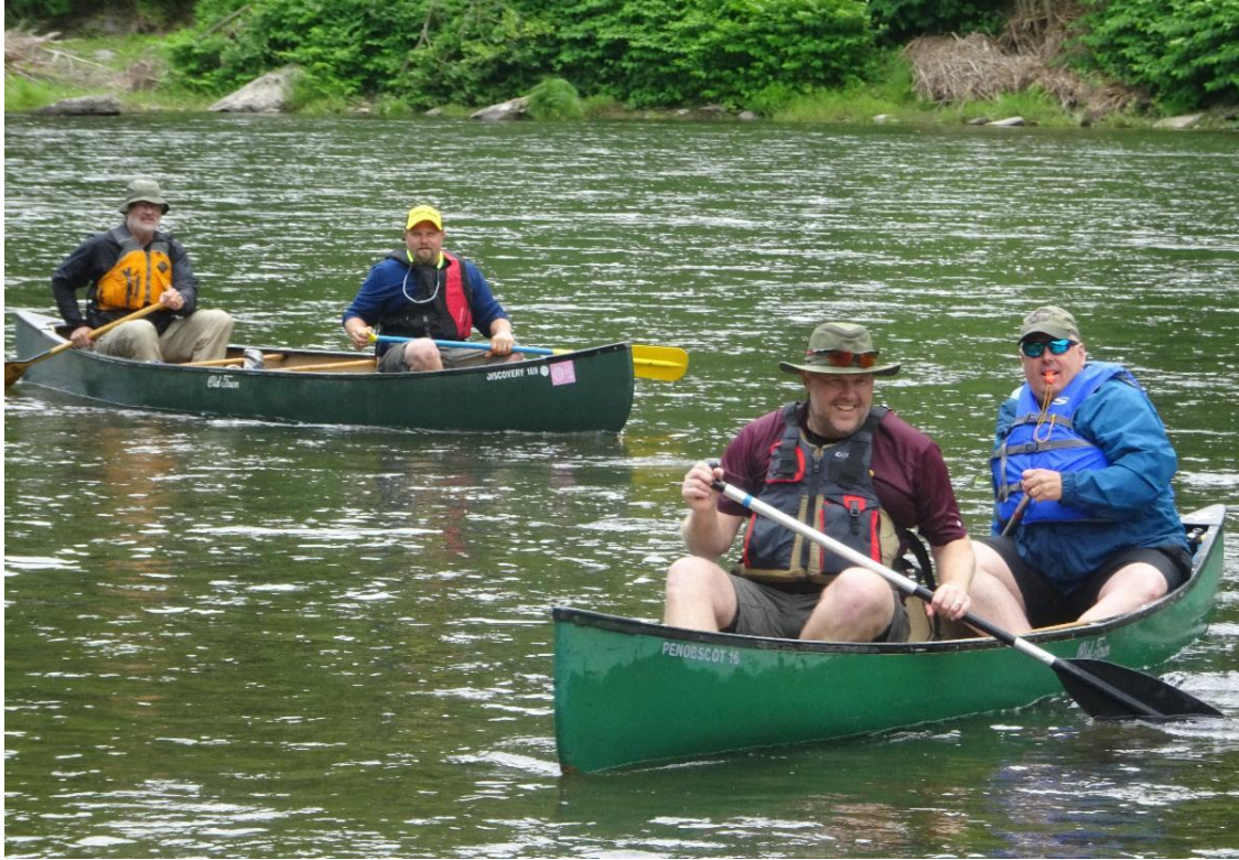
June 17-19th - Canoeing the Upper Delaware River.