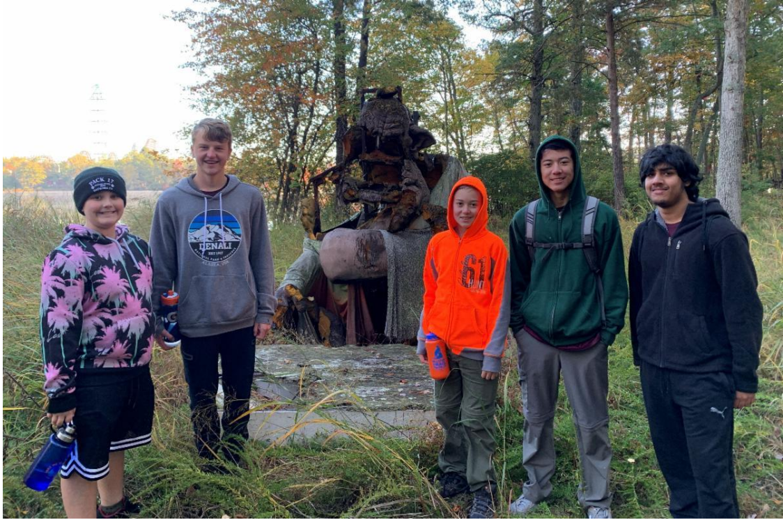
October 14-16th - We attended the Jersey Shore Council Camporee at Six Flags