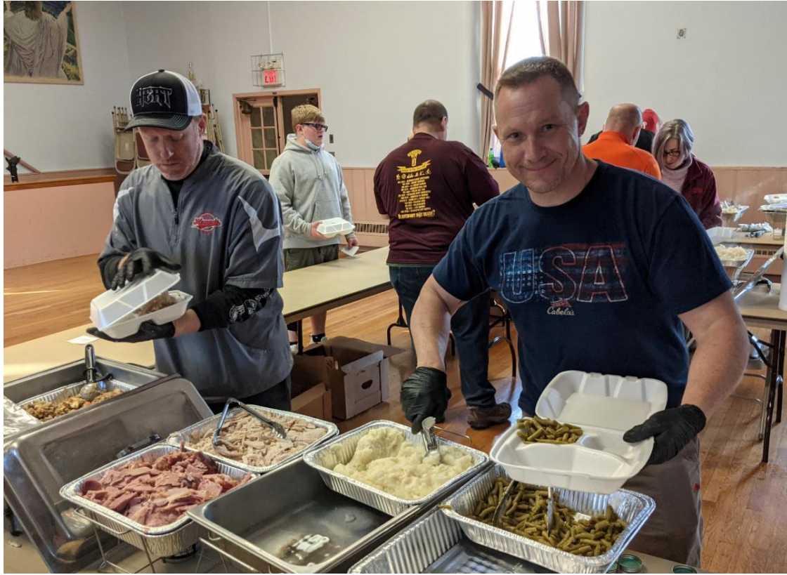
March 5th - Ham and Turkey Supper.