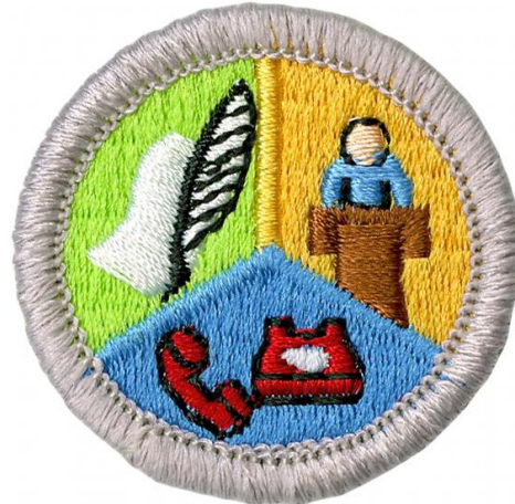
Communications: Tom Dutill