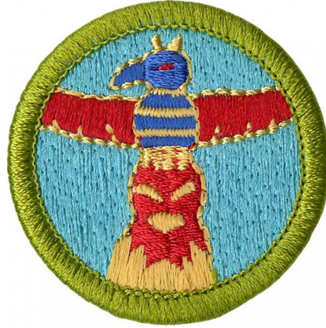
Woodcarving: Apollo Marks