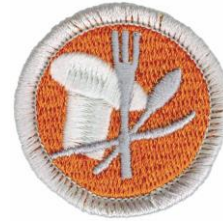
Cooking Merit Badge: Dean Barbor