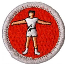
Personal Fitness Merit Badge: Charlie Batman