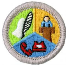
Communications Merit Badge: Apollo Marks