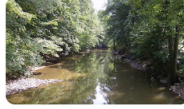
Lorimer Park is a 230-acre public park in Abington Township, Pennsylvania. Lorimer Park is situated 1000 feet southwest of Camp Melmar.