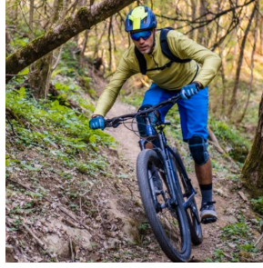
Lorimer Park Park