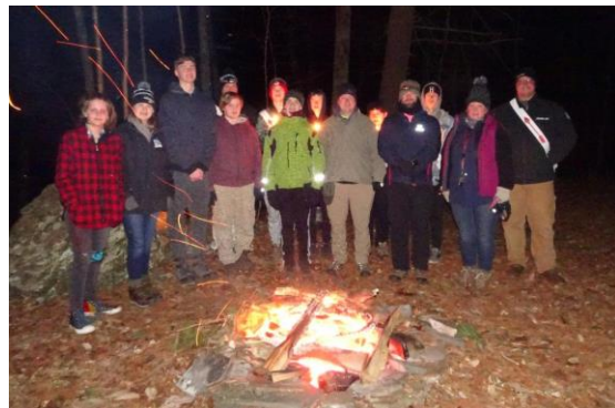
February 2020 - We had an OA Tap Out at Resica Falls with Troop 818. Here are the Ordeal candidates.