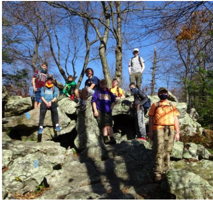
November 2020 - We camped at the Blue Rocks Family Campground and hiked at the Hawk Mountain Sanctuary.