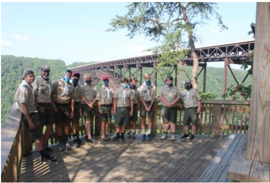
July 2020 - On our way home from the Summit we stopped at the New River Gorge Bridge. Look familiar? Check the back of a West Virginia quarter.