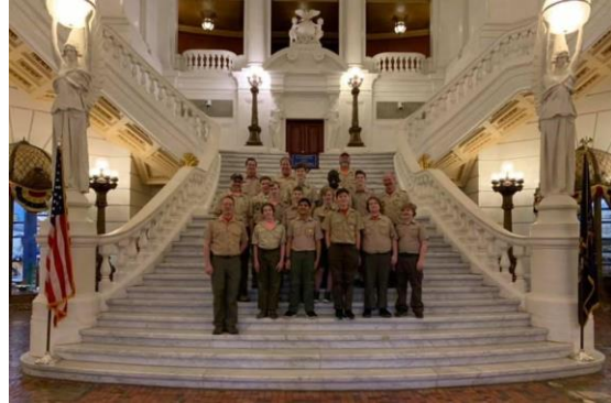
January 2020 - We camped at Fort Indiantown Gap and visited the State Capitol Building and Pennsylvania Farm Show. Here we are on the steps in the atrium of the Capitol.