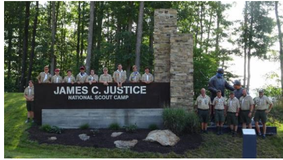
July 2020 - After rescheduling a couple of times, we have summer camp at the Summit Bechtel Reserve in West Virginia.