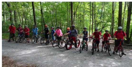
August 2020 - We biked about 25 miles on the D&L Rail Trail from White Haven to Glen Onoko, and camped at Hickory Run.