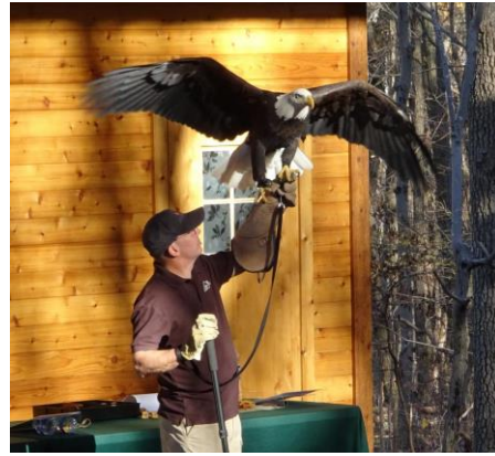
November 2020 - Opening weekend for eagle migration at Hawk Mountain. We were able to see some awesome birds up close during a ranger talk.