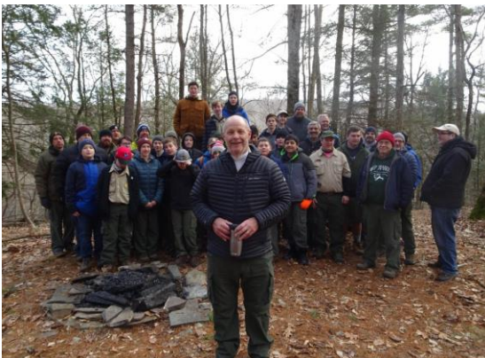
February 2020 - We took our annual trip to Resica Falls and camped in Firestone Lodge. Here we are after our Scout's Own down near the Bushkill