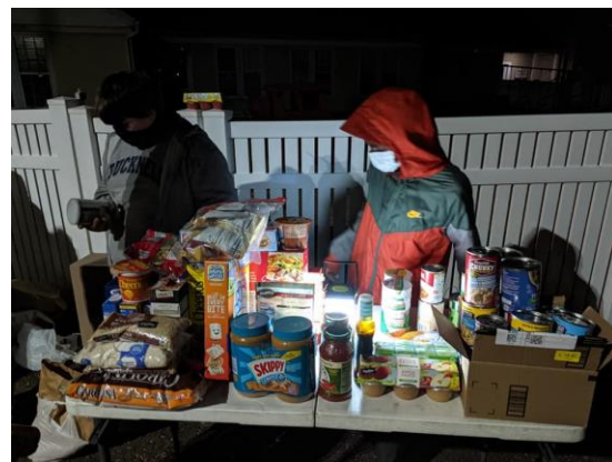
November 2020 - During the Scouting for Food campaign, the troop collected 1,275 food items for the Food Pantry at Lehman Memorial Church.