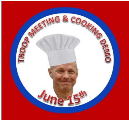
June 2020 - In person troop meetings resume outdoors.